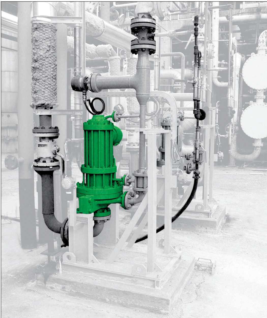
▲ Fig 2 Single-stage canned motor pump type CNPFV 80x40x290 in vertical design

HERMETIC-Pumpen GmbH Fax-Info +49 761 5830-280 Tel-Info +49 761 5830-0 Lau.Dieter@lederle-hermetic.com www.lederle-hermetic.com Achema 2009 Hall 8, O48-P51